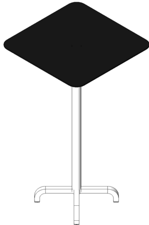
④ 3D View