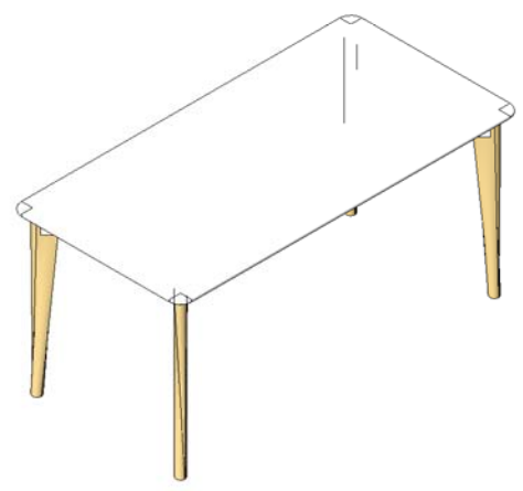
④ 3D View