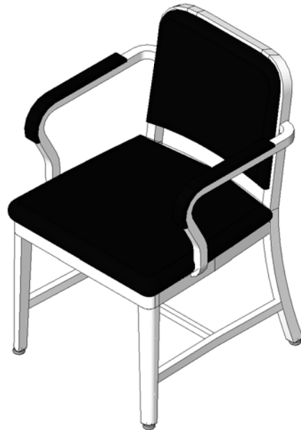
④ 3D View