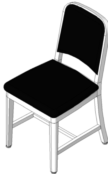
④ 3D View