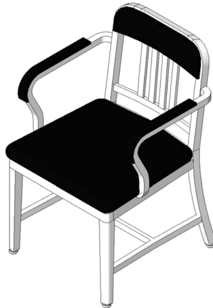
④ 3D View