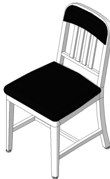
④ 3D View