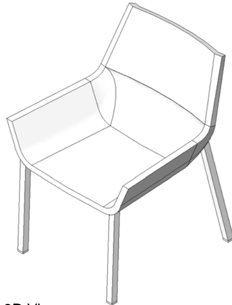
④ 3D View