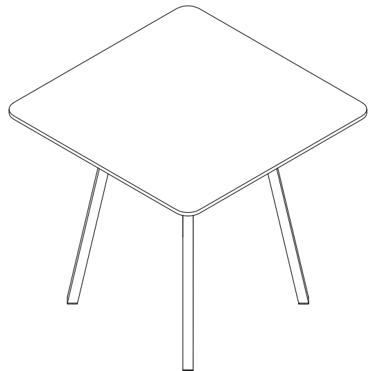
4 3D View